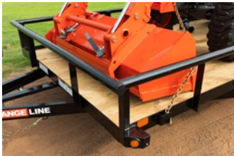
Durable pipe top rail for added strength.