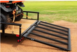
4' tall spring-loaded rear ramp gate for easy loading.