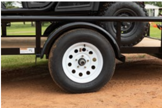
American-made Premium Axles with low-maintenance Quick Lubricating Hubs.