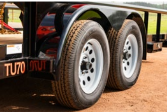
American-made Premium Axles with low-maintenance Quick Lubricating Hubs.