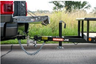
Set-back jack design to prevent tailgate damage on tow vehicle.