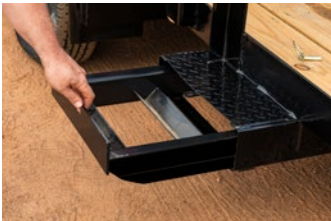
Stowable slide-in ramp package allows great versatility when loading equipment.