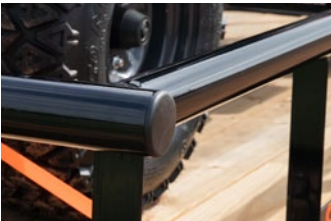
Pipe top rail and channel tongue design for improved durability.