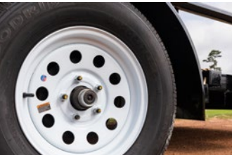
Forward Self-Adjusting Electric Brakes on all hubs for improved safety and stopping power.